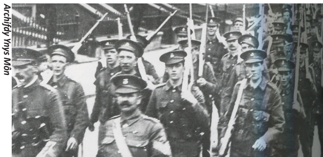
Royal Welch Fusilier volunteers in Caernarfon, 1912. How many would survive the decade?

With his Pages in the Sea project, film director Danny Boyle, a one-time graduate of Bangor University, seems to have devised a peaceful and thoughtful way of remembrance, without drums, flags or marches. Similar commemorations took place at Ynyslas, Swansea, and Freshwater West.