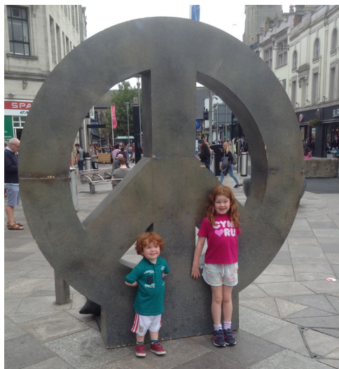
Here's to the future! Cardiff supports a Global Ban. CND at 60 session, September 2018.

There can be no winners in a nuclear arms race. Even if we are lucky enough to avoid a nuclear war, we all still lose as resources and ingenuity are directed towards building more nuclear weapons, instead of addressing the very real problems facing the world and its people.