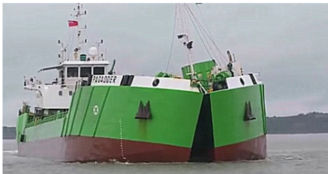
Each load dumped weighs 2,000 tonnes. Operations are expected to resume after the winter.