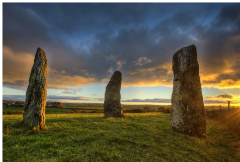
Standing stones near Wylfa date from the Bronze Age. Proposed waste from Wylfa B would remain radioactive 100 times longer than the period these stones have already existed.