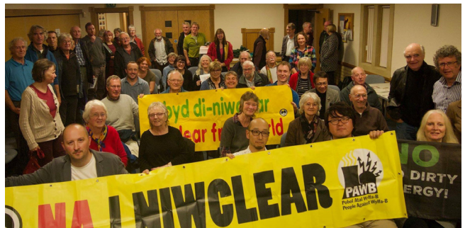
PAWB welcomes Japanese campaigners to Bangor, October 2018

https://www.change.org/p/stop-hitachi-s-wylfa-nuclear-project?