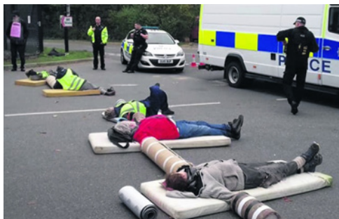
No more warheads! Protestors blockade AWE Burghfield in October 2018 (see p8)