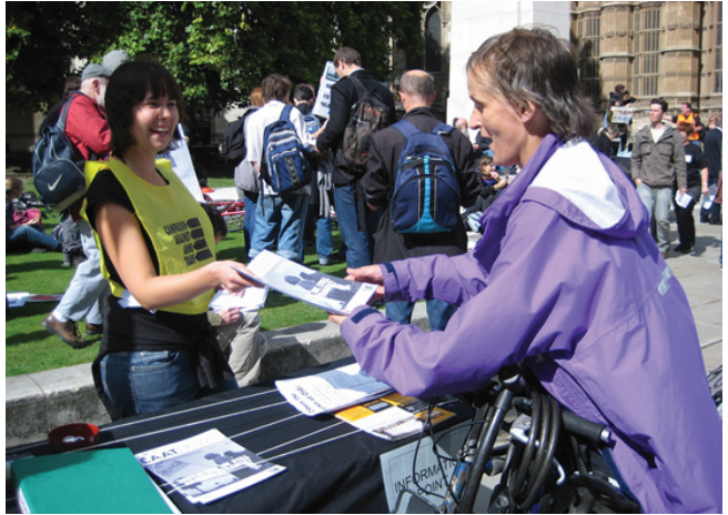
Quakers in Britain

Further details regarding the scheme can be found here: www.quaker.org.uk/our-work/peace/peacemakers , whilst more detailed information and an application form can be found here: www.quaker.org.uk/job-opportunities/jobs .