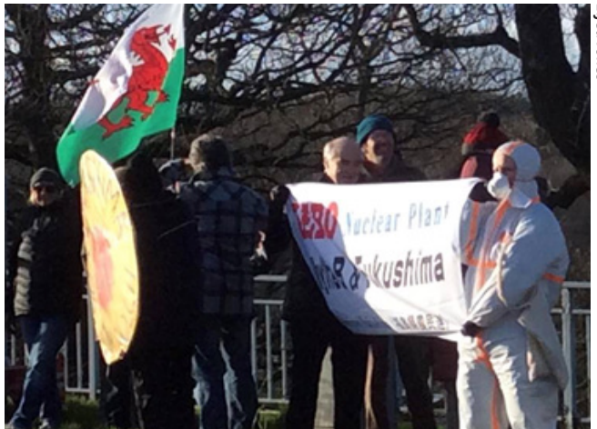
11 March 2019: protestors against Wylfa B gather by the Menai Suspension Bridge to mark the 11th anniversary of the Fukushima disaster.

The Wylfa B project was hyped from the start, and the politicians who held it out as a panacea to the public have palpable