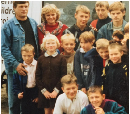
1995 At Vaselivichi In the Chernobyl-polluted Gomel Region of Belarus. The ambulance, after unloading the medicines at hospitals across the area, was donated to an orphanage.