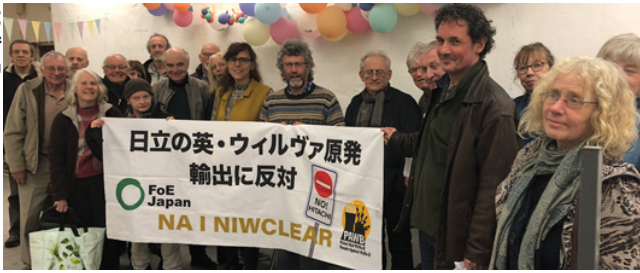
What happens next? Campaigners discuss the issues in Caernarfon.

disappointment and some anger to contend with. PAWB (People Against Wylfa B) has always considered economic and environmental alternatives, publishing a prospectus called Manifesto Môn back in 2012. PAWB is now reconsidering renewable energy options and engineering, regeneration of communities, new transport possibilities and cultural projects. In March 2019 the IWA (Institute of Welsh Affairs, a think-tank)