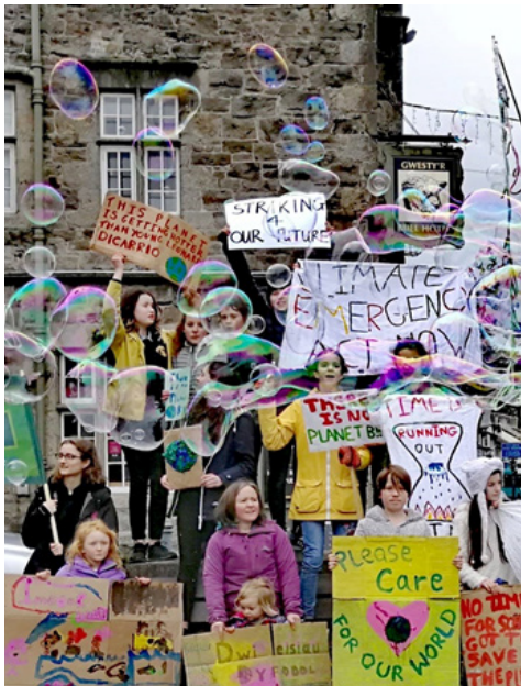
Bubbling up! Kids in Llangejni take action on climate change, 15 March 2019