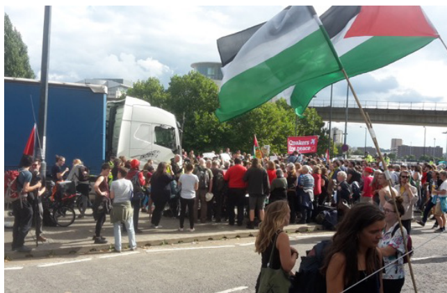
Protestors in Cardiff block the lorries of the war profiteers

• UK arms sales over the last two years have soared, many of them to countries with an appalling record of human rights or aggression. In March 2017 arms trade protestors