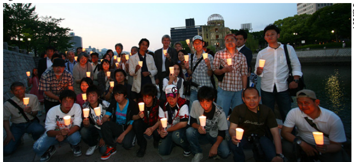
Vigil at Hiroshima: never again.

Yes. In exercising its sovereignty, a nation can withdraw from the treaty. It must provide 12 months’ notice. However, it cannot withdraw if it is involved in an armed conflict.