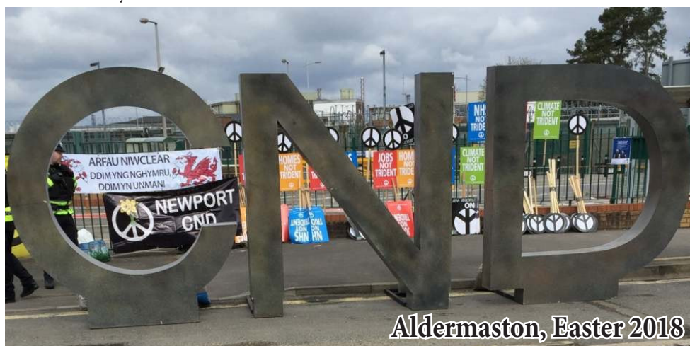
Aldermaston, Easter 2018

For the most up to date information on all our campaigns and for details of meetings and activities across Wales.