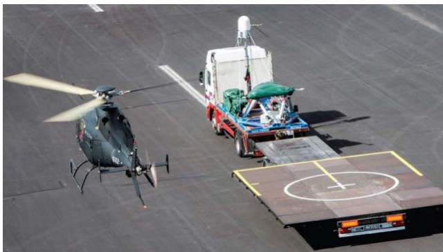
Helicopter (RWUAS) drone on test at Llanbedr, May 2015