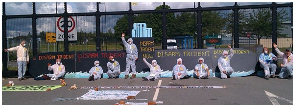
Protestors with a giant plywood submarine 'locked on' to block the Construction Gate most effectively.