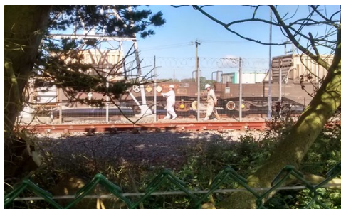
A nuclear flask is loaded onto a DRS train at the Valley railhead.

DRS trains travel through congested junctions,