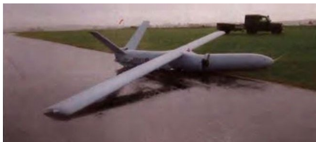
The crashed military drone: 'Left hand down a bit.....'

Freedom of Information requests have revealed that the Welsh government, the Welsh Development Agency, the local authority and the EU invested about £17 million of public money into the development of Parc Aberporth between 1999 and 2015. Politicians of all main parties promised job creation. We now know that just 3 permanent staff support flights from Aberporth, and that there are only 8 other full-time staff (and 20 to 40 people who pop in now and then).