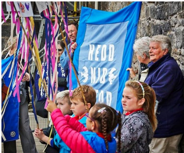
Caernarfon: International Peace Day, September 21st 2016 (see p.4)