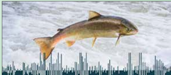
The Rivers Trust