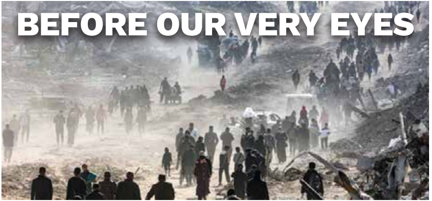
The endless war. Gaza is parcelled up, and paramedics are executed by the IDF.

As a Church in Wales priest, I strongly believe in one of our main commandments – ‘thou shalt not kill’. It’s simple, unambiguous, there’s no room to play around with ‘except for...’. Do not kill. In our sorry history as humanity, war, violence and conflict have arisen many times, beyond our ability to count the lives lost. We have just marked the 80th anniversary of the liberation of the camps at Auschwitz-Birkenau and now scenes of genocide fill our screens once more. How easy it is to forget our ‘never again’ promises.