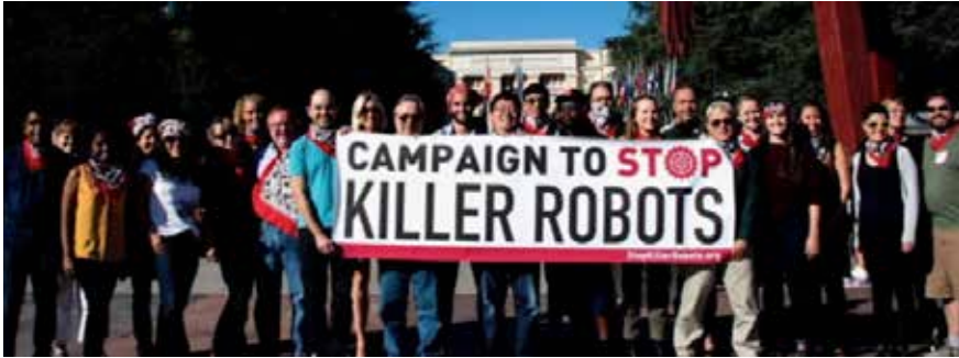
Protests at the United Nations in Geneva – but since 2013 support for a Convention has been effectively paralysed.