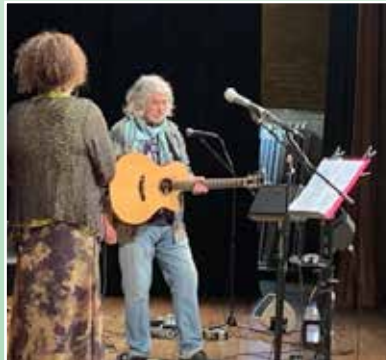
Pembrokeshire, Swansea, Caernafon.