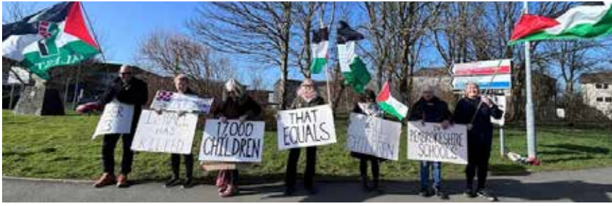
Haverfordwest supporters call for Solidarity with Palestine.