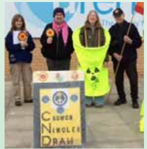
Urenco protest, Capenhurst.

Naoto Kan addressing a rally at Wylfa. The nuclear power lobby has still not given up so neither have we. On 11 March 2025 supporters of CADNO, PAWB and CND Cymru gathered on the Menai Suspension Bridge to support the current campaign and our friends in FoE Japan.