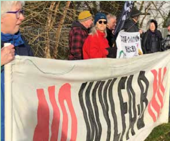
Enough of this nuclear nonsense! Ynys Môn 2025

So, as we look forward, the greatest hubbub will be around the competition to build modular reactors. That will be another step on the journey, but the same problems will remain regarding cost, the production of toxic radioactive waste, the risk of accidents and leaks, and the close connection between civil and military nuclear.