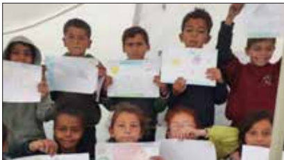
The School is called Sumud, an Arabic word meaning persistence and resilience - something Palestinians have developed a lot of in the last 75 years.

District of Gaza City. Despite huge problems they managed to re-open the School on 19 February 2025. However the collapse of the ceasefire has now made made it too dangerous to keep the school open. It is very difficult to predict what the future will hold. Nevertheless we believe it is important to do what we can NOW.