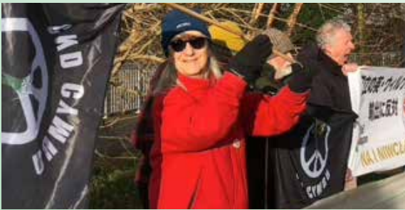
Menai Bridge commemorates Fukushima.

Flying Services, training pilots. This is a 50-50 partnership between US firm KBR and Israeli-owned Elbit Systems UK. Elbit makes bombs, missiles, drones, tanks and helicopters. Their weapons have enabled the slaughter of so many thousands of civilians in Gaza and the West Bank. Children's clothing was draped onto the runway fence while jets roared overhead.