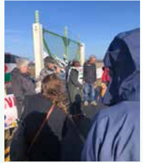
Elbit Systems protest at RAF Valley

On 24 February 2025 there were early morning banner drops from four bridges along the A55 followed by a protest at RAF Valley, Ynys Môn , as part of an international action called for by World Beyond War. The aim was to draw attention to the links between RAF Valley and the Gaza genocide. One of the companies embedded at RAF Valley is called Affinity