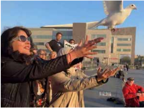
The worldwide surge in militarism is being challenged here in Wales, as at the above event in Cardiff Bay on 5 March 2025.