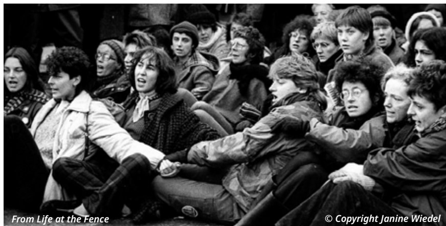
From Life at the Fence