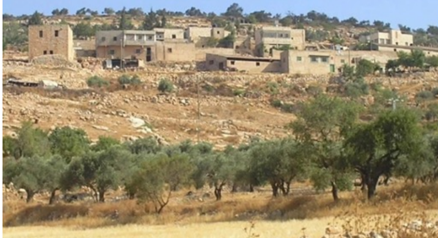
Yanoun and its olive trees