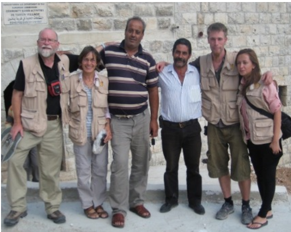
EAPl team 43 in Yanoun, September 2012