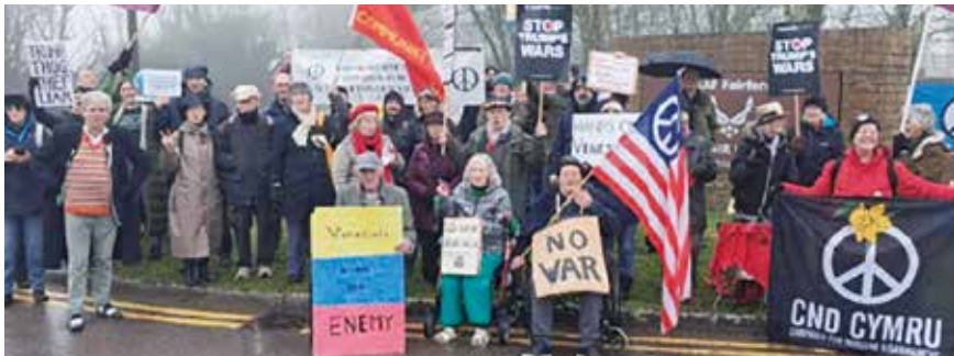
Braving the winter weather at RAF (USAF) Fairford in Gloucestershire, 18 January 2026. They are protesting at the USA's illegal seizure of oil tankers off the coast of Venezuela.

The USA is not a reliable ally. The 'finger on the nuclear trigger' belongs to a President who is volatile and inconsistent, who does not respect international law.