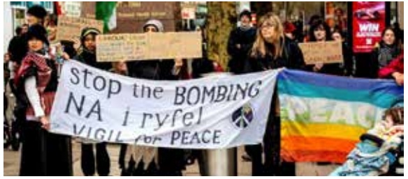
Cardiff vigil, St David's Day 2026. Another illegal and unmandated war rips across the Middle East. In we jump, as Starmer eventually agrees to US flying from 'RAF' bases. Only the Iranian people should determine their future, not Trump and Netanyahu. STWC Caerdydd

The UN and its agencies are being deprived of funding by the USA and other countries. Defunding is a hammer blow to all our hopes for a better planet. Without sufficient funding, the UN is impotent. Israel, which constantly ignores UN resolutions, and the USA, constantly attack Guterres