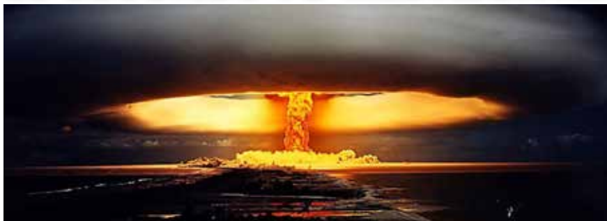
Really? Back to this? Nuclear testing in French Polynesia 1971