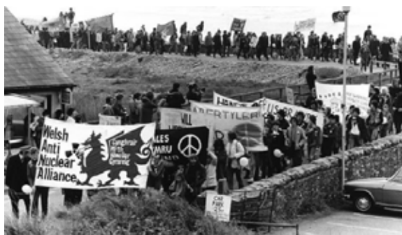
The way we were: 23 February 2026 marked the 44th anniversary of the signing of the Nuclear Free Wales Declaration.