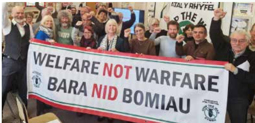
A timely message from a Stop the War conference at Mold, which coincided with the reprise of the illegal Israeli-US war with Iran. STWC Cymru