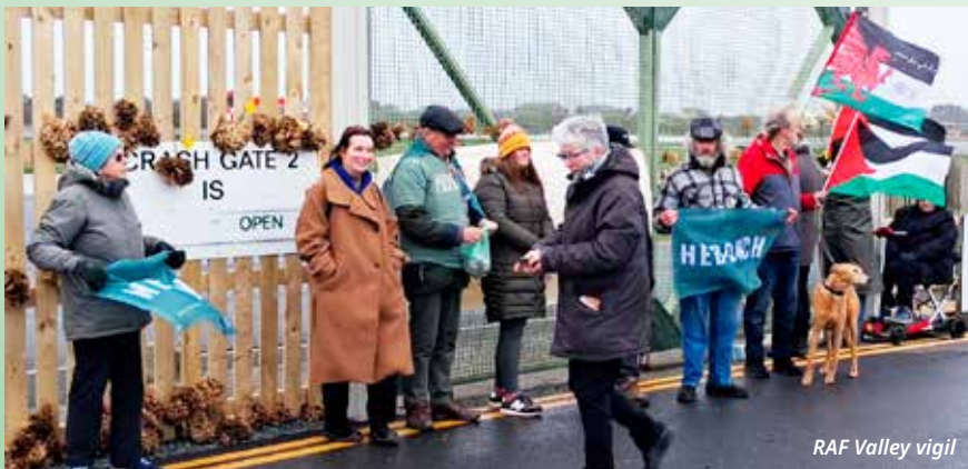
RAF Valley vigil